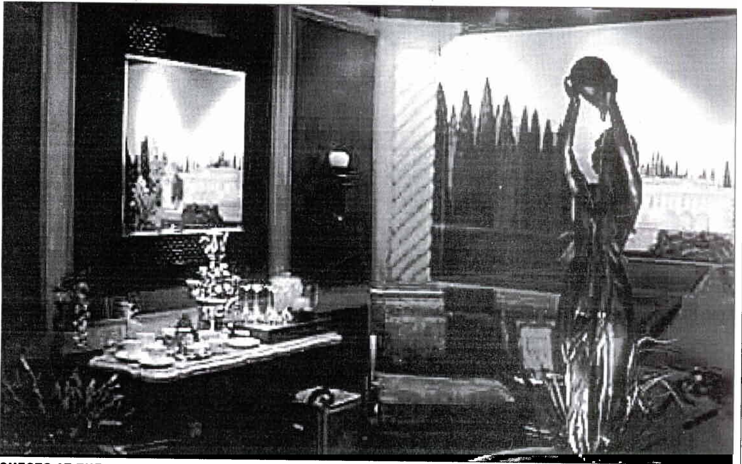
GUESTS AT THE TALEGA DAY Spa can visit the relaxation room for a lunch break facial. Price is $55.